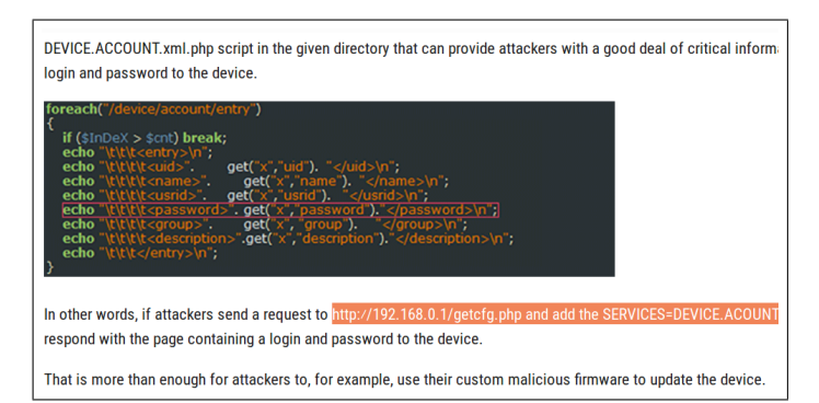
Fig. 6. Snippet from 12-Sep-2017 advisory for D-Link DIR8xx Multiple Vulnerabilities [24].

It is interesting to notice the same /getcfg.php in both these advisories. Also, note the <password>*</password> tags in Figure 6, which resembles a lot the previously presented exploits from 2008 and 2013. Also, the advisory title "Enlarge your botnet with: top D-Link routers" from [24] suggests that some recent IoT malware botnets have been or might be abusing it already. Finally and again, both these advisories do not have or provide a CVE number for the vulnerability related to exploitation of /getcfg.php and <password>*</password> tags.